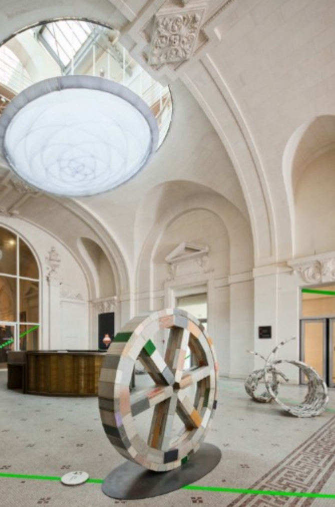
Foreground: Wade Saunders. Convey . Background: Maarten Stuer. Mouvement Cyclique .